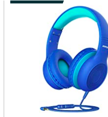
Headphones in large baggie with name on it 请把耳机放在一个大袋子里，上面写着你孩子的名字。