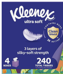
2 boxes of tissues 2盒纸巾