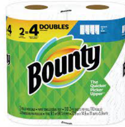
1 roll of paper towels 1卷纸巾