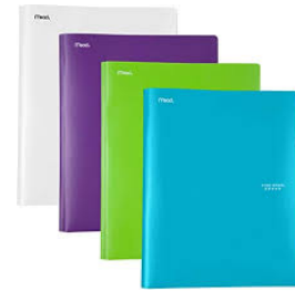
3 plastic folders- 1 red, 1 yellow, 1 green 个黄色文件夹 一个红色文件夹

您可以在Staples或亚马逊上购买。确保获得主要的K-2，顶部有用于画图的空间。