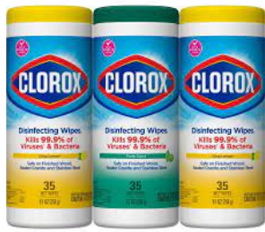
2 Clorox Wipes “Clorox” 清洁湿巾