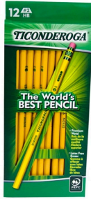
1 pack pre-sharpened 1包预先削尖的铅笔