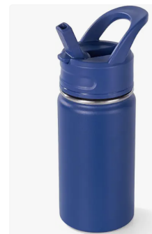
Water Bottle 水瓶