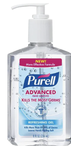
1 bottle of hand sanitizer 个酒精洗手液