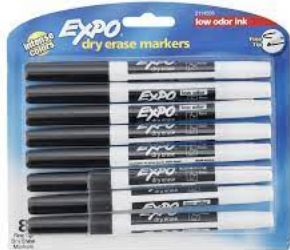
2 packs or one 12 pack (THIN black) dry-erase markers 包带橡皮擦的薄世博记号笔