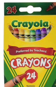
1 pack 包 24 支蜡笔