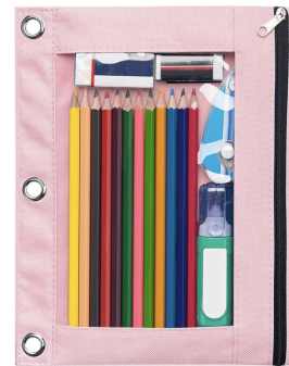
Soft pencil case, any color 软铅笔盒, 颜色任意